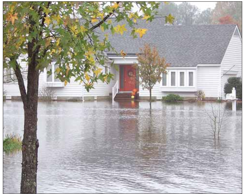
James City County during Tropical Storm Hanna.