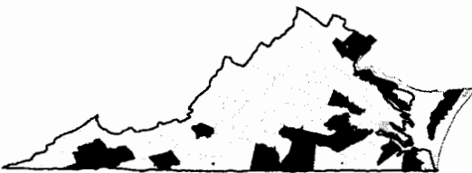
Virginia Localities with EMS Fee's

* Jurisdictions currently involved in Revenue Recovery