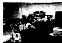
A 911 Call is Received..

Regardless of their Insurance Coverage or their Ability to Pay!