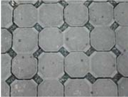
Permeable Interlocking Concrete Pavers (PICP)