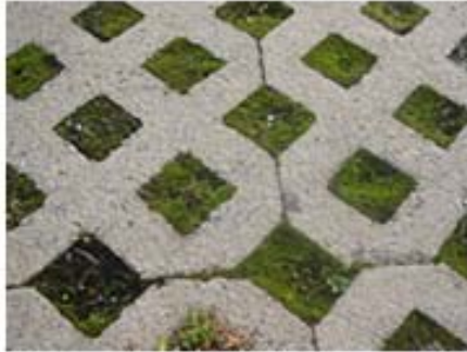
Concrete Grid Pavers (CGP) "Turfstone"