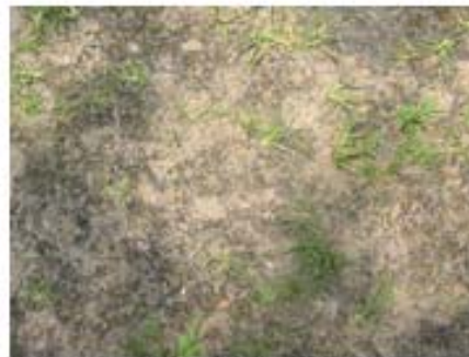
Plastic Turf Reinforcing Grids (PTRG)

Note: Permeable interlocking concrete pavers (PICP) are the most commonly used type of pervious paver block systems for residential applications. Porous asphalt (PA) is the least commonly used. The County does not endorse or recommend any specific type of pervious paver block system, any particular paver stone, manufacturer, or installation or testing contractor.