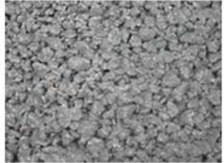
Porous Concrete (PC)