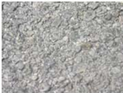
Porous Asphalt (PA)