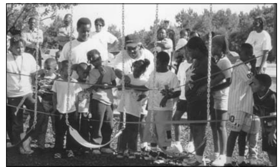
Children from the Burnt Ordinary community cut the ribbon to mark the dedication of their new playground equipment.

The Burnt Ordinary Neighborhood Association (BONA) recently organized, with residents attending a five-week Leadership class and electing new officers. The new officers organized a Children's Day in October to celebrate and dedicate new playground equipment. Seventy-five people enjoyed food, games, speakers, health screenings, McGruff, the Bookmobile and the JCC Fire Department equipment demonstrations.