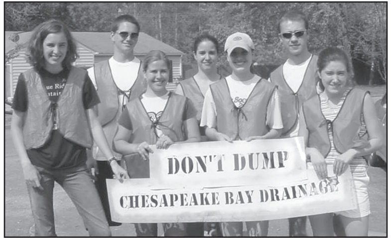
Sharpe Community Partnership Program students complete storm drain project.

Students from the Sharpe Community Partnership Program completed a storm drain inlet stenciling demonstration project in the Powhatan Creek Watershed. Students labeled each storm drain inlet with "Don't Dump - Chesapeake Bay Drainage" in Longhill Station, Mulberry