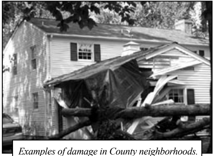
Examples of damage in County neighborhoods.

Hurricane Isabel did substantial damage in James City County on September 18. In the next edition of "FYI," we'll provide you with details of the devastation and the recovery. A reminder, if severe weather threatens our area, listen to your local radio and television stations for the latest information. Two radio stations – WXGM 99.1 and Eagle 97.3 and television news station WWBT Channel 12 (Richmond) provided consistent events during the Hurricane Isabel recovery. Also watch JCC TV48 and call the County's Emergency Hotline Number at 875-2424 for the latest information.