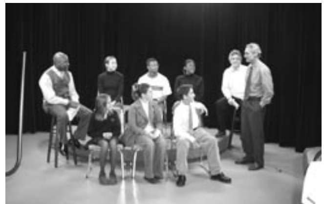
During the 2003 update of the County’s Comprehensive Plan, local youth participate in a televised youth forum.

Subscribe to JCC TV48 weekly program schedule at www.jccEgov.com