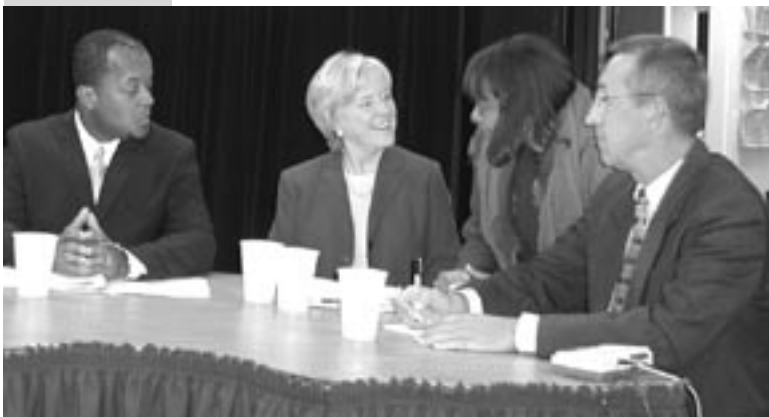
Williamsburg/James City County School officials prepare for a live call-in show on the third high school.