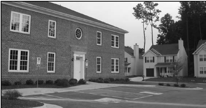
Ironbound homeowners can walk to County offices.