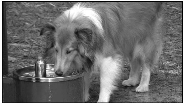
This sheltie enjoys freedom at Waller Mill Dog Park.

Dog owners now have a place to let their dogs run off-leash at the Waller Mill Dog Park on Airport Road. James City County and Williamsburg worked together to build the park. County and City residents may register and pay $10 per year for the first dog and $5 for each additional dog. The daily fee is $2. For more information, call Williamsburg Recreation at 259-3760 or Waller Mill Park at 259-3778.