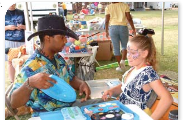
Face painting is a popular activity for young fairgoers.

For more information, visit jccEgov.com or call 564-2170 .