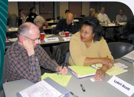
Members of the 2008 Citizen Leadership Academy discuss community issues.

Register with Neighborhood Connections by calling 259-5422 no later than March 2.