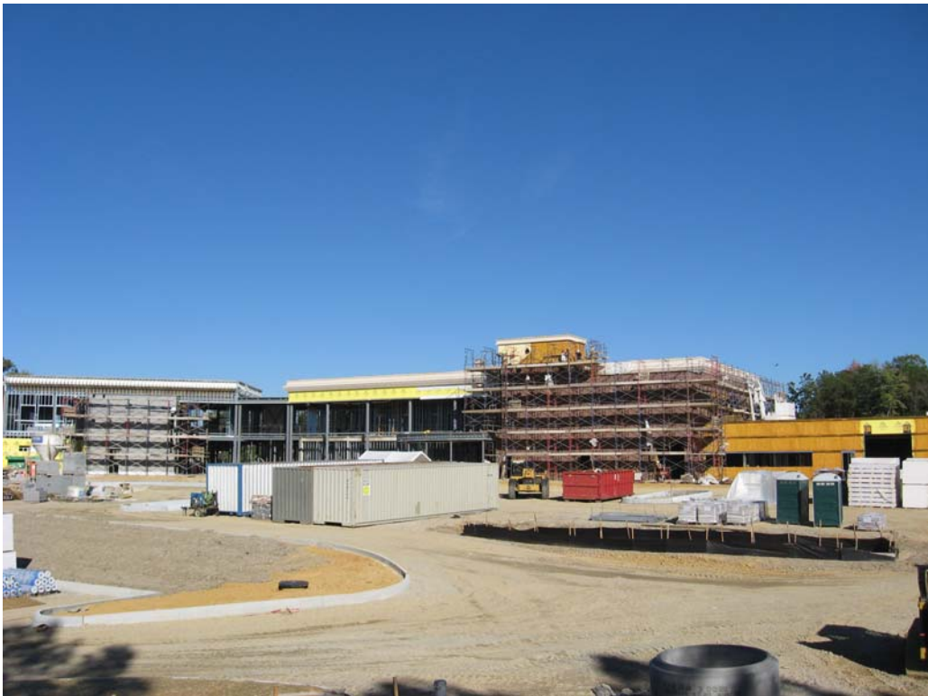
OVERALL VIEW OF SITE IMPROVEMENTS, EMPLOYEE PARKING AREA