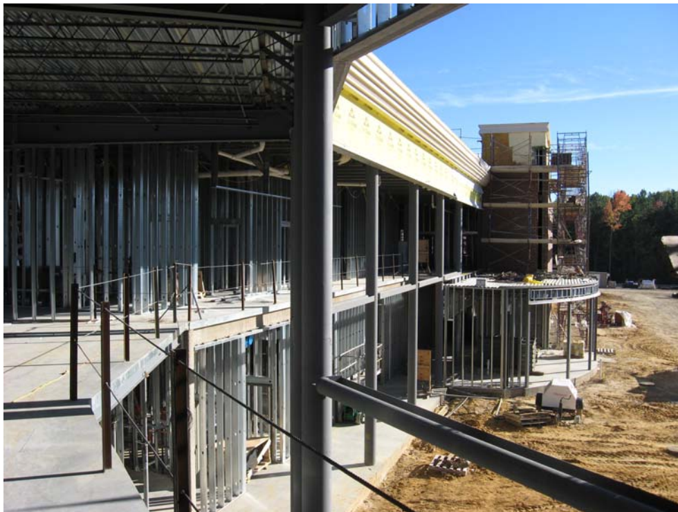
METAL FRAMING INSTALLATION, EIFS INSTALLED ALONG PARAPET WALL