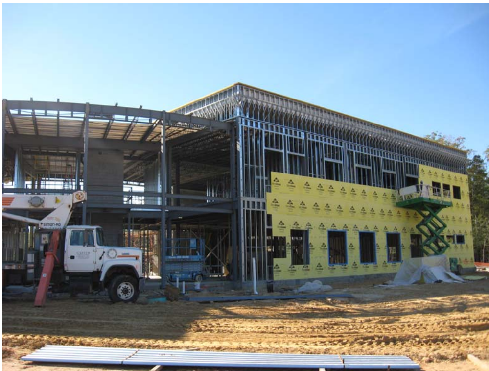
STEEL ERECTING AT FRONT LOBBY, EXTERIOR SHEATHING INSTALLATION