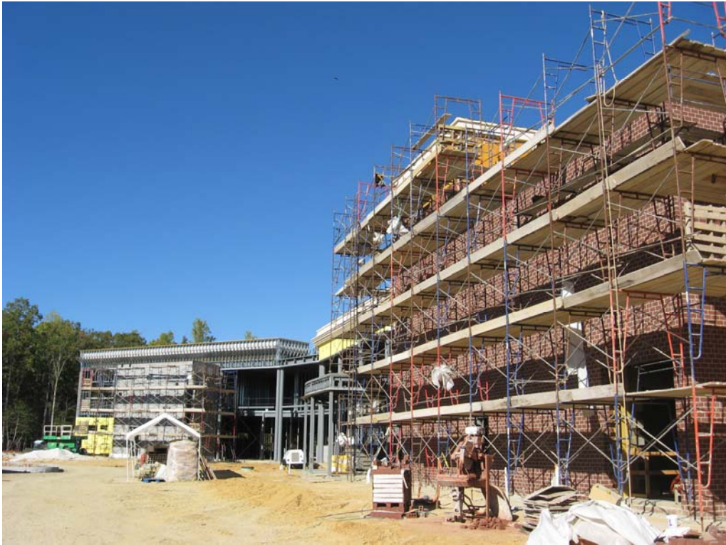
RECYCLED BRICK INSTALLATION ON EXTERIOR OF BUILDING