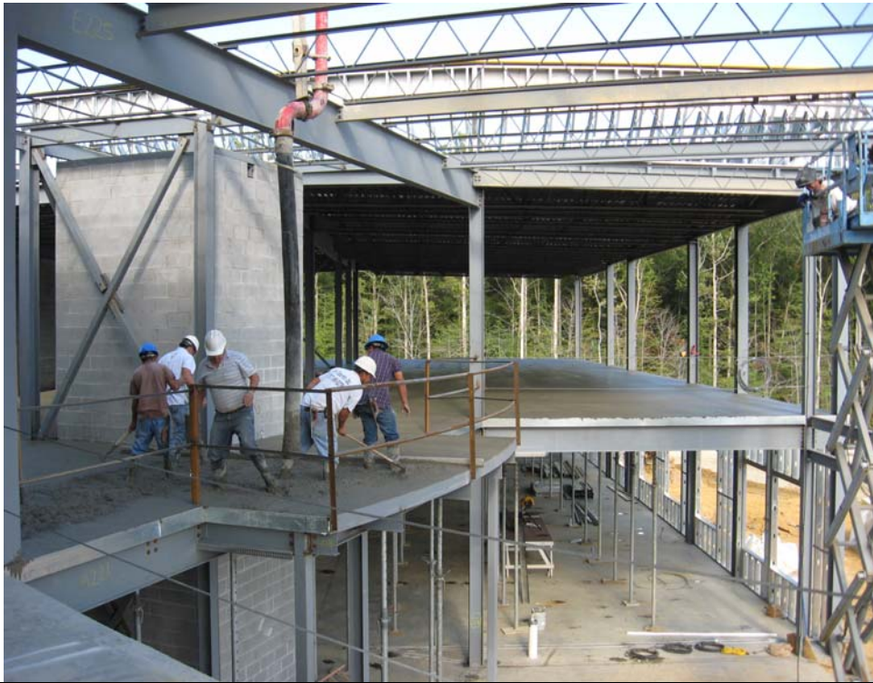
SECOND FLOOR SLAB PLACEMENT, COMMUNITY SERVICE AND LOBBY AREA