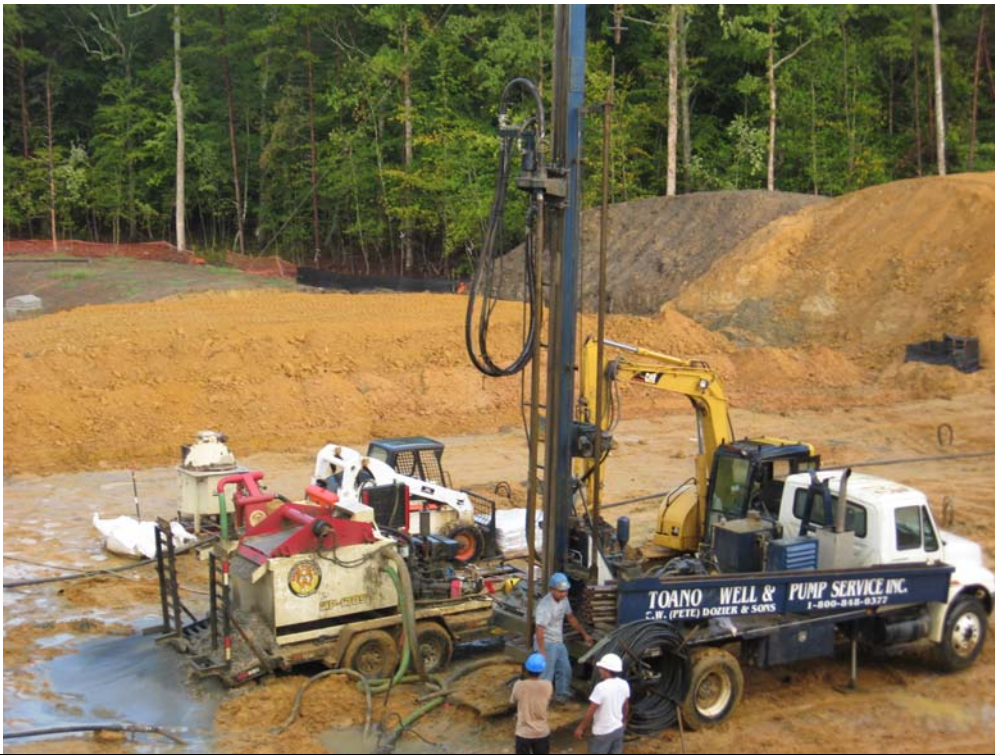
GEOHERMAL WELLFIELD INSTALLATION