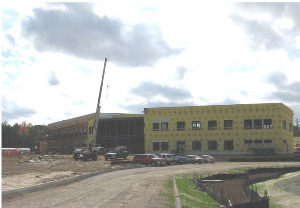
OVERALL FRONT VIEW OF NEW POLICE HEADQUARTERS BUILDING