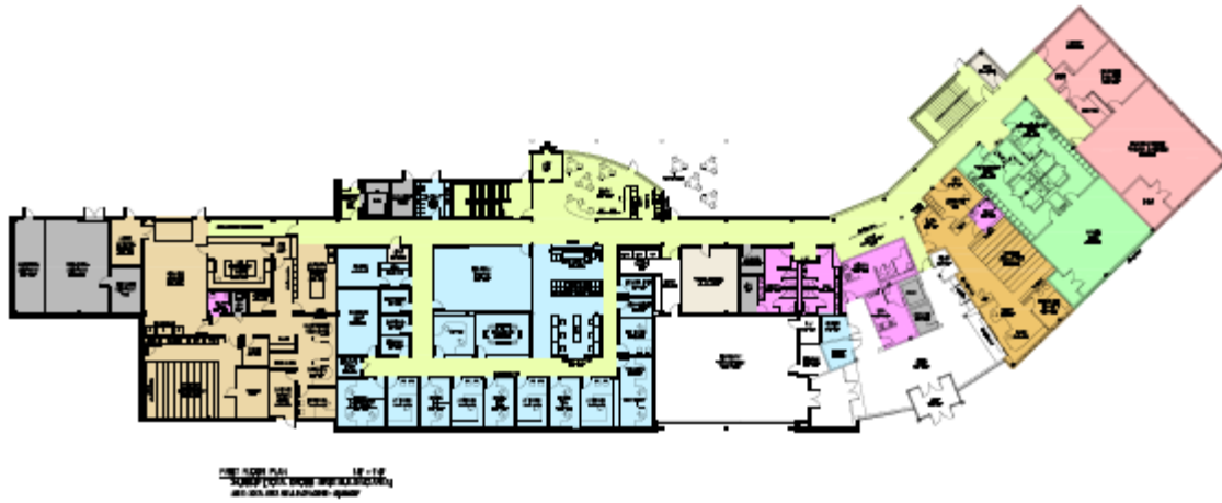
Preliminary Layout of First Floor