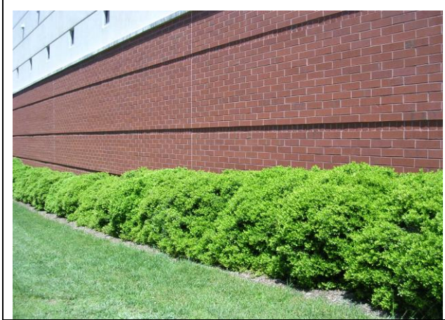
View of site before construction