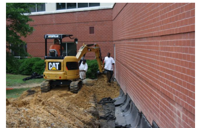
Backfilling disturbed area