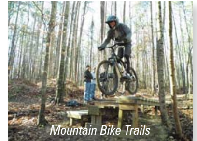
Mountain Bike Trails