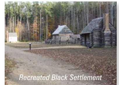
Recreated Black Settlement

Completion of the third of three recreated cabins, furnished with items authentic to the 1803-1850 period. Together, the site is nationally recognized as one of the earliest free black communities in America, offering a rare glimpse into the life of slaves, African Americans and Black Americans between 1803-1860.