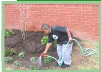
Above: Youth water flowers after the planting of an America's Anniversary Garden.

James City County 4-H partnered with James City County Parks and Recreation Youth Programs to install an America's Anniversary Garden to commemorate the first permanent English settlement in America. Participants from the STRIVE and Beyond the Bell programs learned horticulture landscaping skills from the Junior Master Gardener Curriculum. Youth learned about landscape planning, design, installation, and maintenance. To put their newly learned knowledge to work, participants used red, white, and blue trees, shrubs, and flowers to plant a garden at the James City County/Williamsburg Community Center. Cooke's Gardens was a generous supporter of this program and provided the plants for this project.