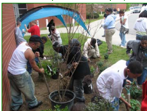
Above: Youth install a fringe tree and other red, white, and blue shrubs at the James City/Williamsburg Community Center.

The Cardinal Clover 4-Her demonstrates qualities of character including respect, fairness, caring, trustworthiness, responsibility, and citizenship.