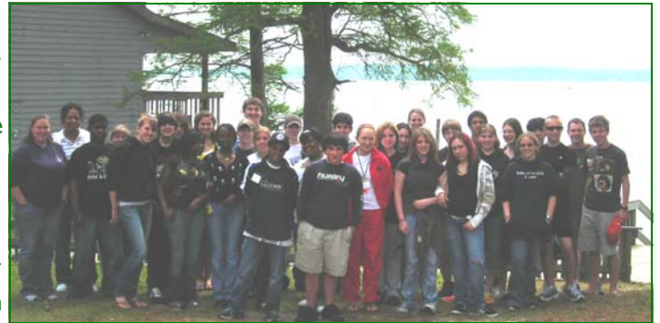
Above: Teen and adult leaders prepare for their roles as camp volunteers for the 2007 James City/Essex 4-H Junior Camp.

Counselors brainstormed activities for programs for camp, designed the camp t-shirt and developed the theme "Sunny Side Up" for the 2007 James City/Essex 4-H Junior Camp. Teen and adult leaders will continue training and practicing for situations such as how to deal with homesick campers and what to do in the event of a thunderstorm until camp begins on June 25.