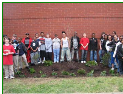
Above: Youth proud of the fruit of their hard work after installing a garden for National Youth Service Day on April 19, 2007..